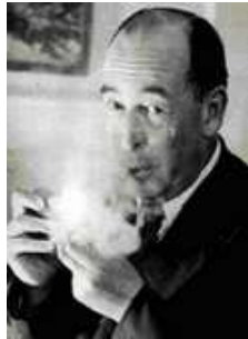
C S Lewis

His sweeping dismissal of Biblical prophecy is almost triumphant in tone.