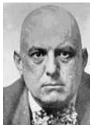
Aleister Crowley Black Magician