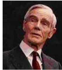
Owen Barfield occult practitioner

Williams had actually been a member of the Golden Dawn, a group dedicated to the study of advanced witchcraft. Its membership included Aleister Crowley, one of the most Satanic black adepts of the 20 th century. Lewis was also greatly influenced by Owen Barfield whom he described as “the best and wisest of my unofficial teachers.” Barfield was an internationally recognised authority on Anthroposophy, an occult offshoot of Theosophy founded by the Austrian magus, Rudolph Steiner, in 1912. He even co-authored several books with Steiner. Like Madame Blavatsky, Steiner taught that Lucifer, the Light Bearer, was the true instructor in the divine mysteries.